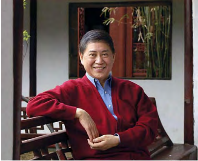
Pai Hsien-yung (Kenneth Pai)

In January 2017, EALCS hosted a one-week series of events in honor of our illustrious colleague, Professor Emeritus Pai Hsien-yung (Kenneth Pai) on the occasion of his eightieth birthday. Entitled "Celebrating Pai Hsien-Yung Through Film & Discussion," the program was organized and sponsored by EALCS and co-sponsored by the UCSB Division of Humanities and Fine Arts and the Center for Taiwan Studies. The week was filled with films and roundtable discussions to explore and celebrate Professor Pai's marvelous achievements as a writer, scholar, opera producer, and much more. Professor Pai's participation in each event was a highlight for those who attended.