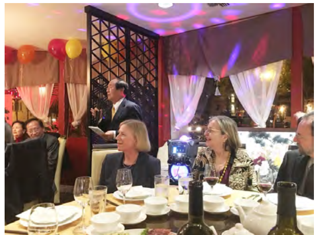
Chancellor Henry Yang speaking at a banquet for Pai Hsien-yung