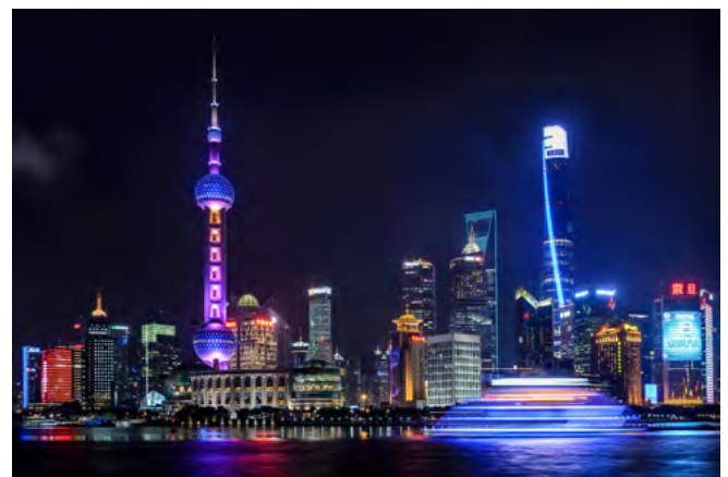
Summer Program Photos